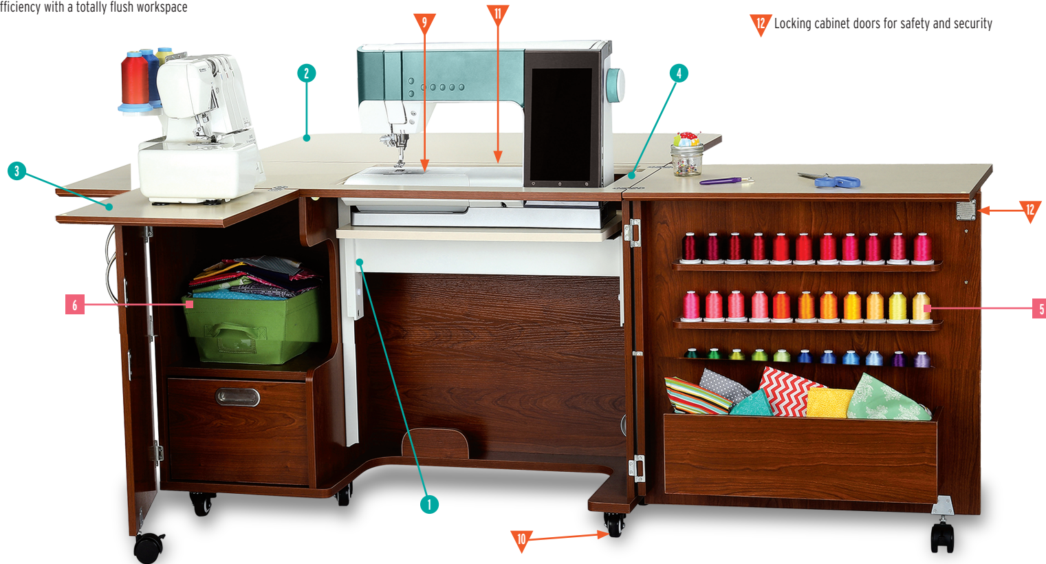
Wallaby II Cabinet