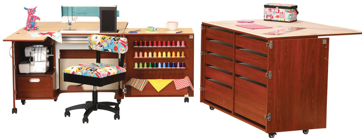
Wallaby II & Dingo II Studio Set with Sew Now Sew Wow Adjustable Height Chair