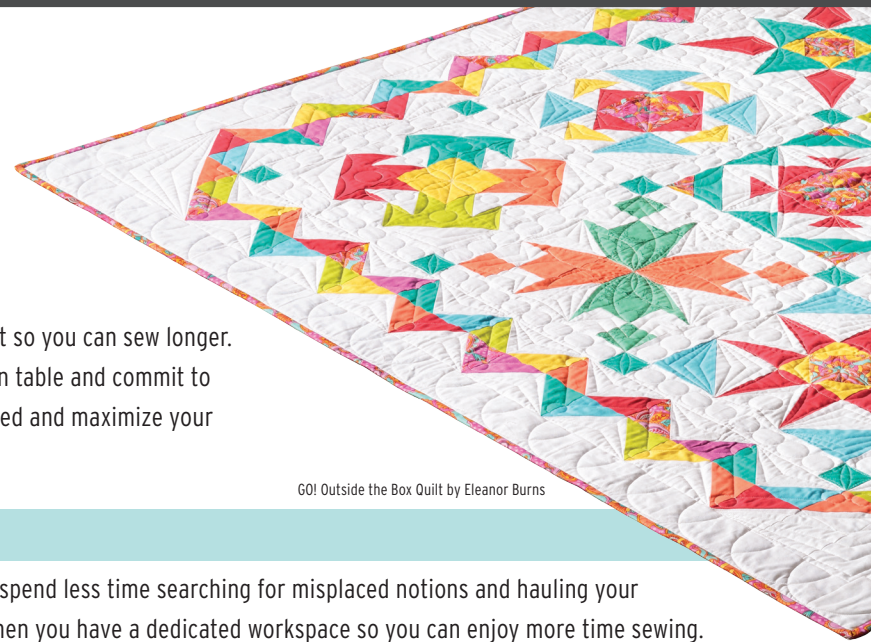
GO! Outside the Box Quilt by Eleanor Burns

Sewing and quilting can provide hours of joy and creativity. When you love what you do, you deserve to sew in comfort so you can sew longer. But without the right workspace, you may find yourself in a lot of unnecessary discomfort. Stop sewing at your kitchen table and commit to using a sewing cabinet to improve the quality of your work and minimize your aches and pains. You'll also get organized and maximize your quilting and sewing time so you can stay focused, creative and energized.