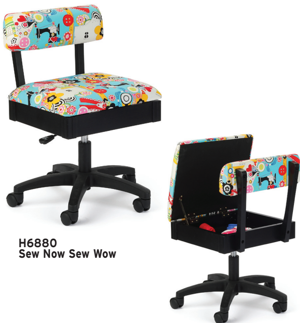
H6880 Sew Now Sew Wow

You've chosen your ideal sewing cabinet, now design your ultimate sewing studio experience! Your workspace is a reflection of who you are, and Arrow offers high quality storage solutions and chairs that not only enhance your sewing experience but also the aesthetics of your sewing room.