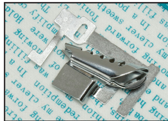
Bias Binder Attachment: