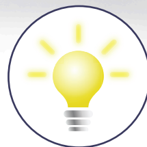
QuiltMaster TM LED lighting: throat, needle, and bobbin