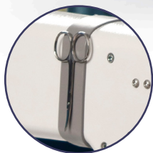
Magnetic tool minder collar