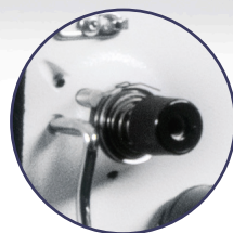
Easy-Set Tension TM