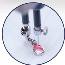
Pinpoint needle laser