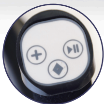
Independently adjustable handlebars with programmable buttons